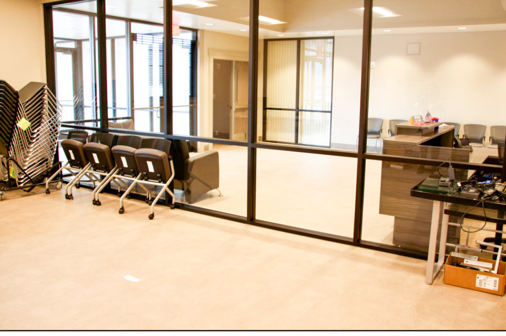
A view through the glass wall of the tabulation room onto the reception/waiting area of the new Voting Center.

Active registered voters will have the option of casting ballots at the Voting Center during early voting, in-person at their predetermined precinct on Election Day, or via mail-in absentee ballot, which may be requested from the Registrar's Office in its new location.