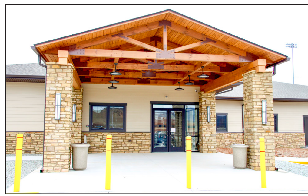
The new Union County Voting Center can be found at 33 Roscoe Collins Drive, just off the Glenn Gooch Bypass across from Union County High.

Ultimately, it just makes sense that the two offices dealing with elections in was an outdated facility where the county occupy the same public viewing of Election Day structure, which also features See Voting Center, Page 4A