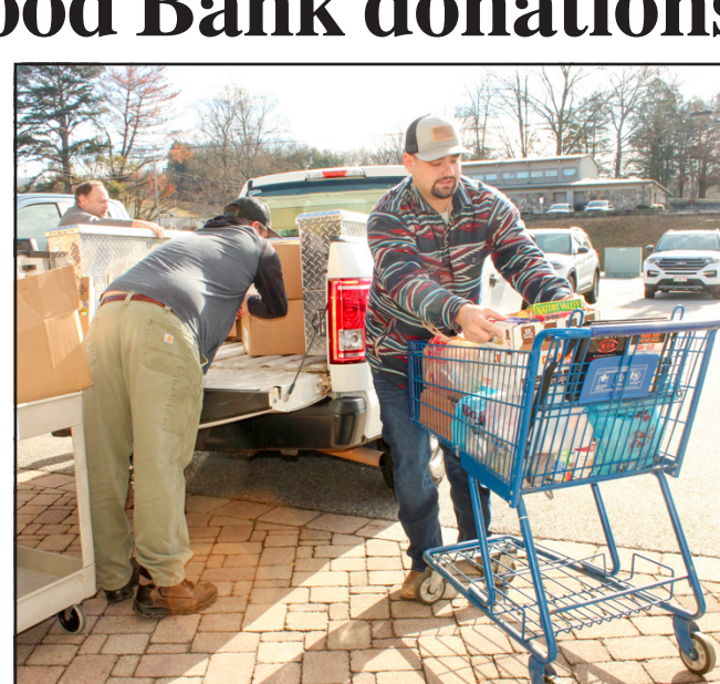
The county made monetary and food donations to the Union County Food Bank this month, seen here dropping off supplies at the Haralson Civic Center.

Meanwhile, food donations come from all over the county, having been dropped