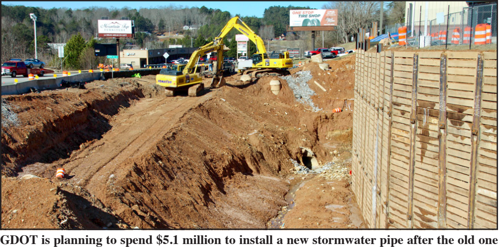
burst in a rainstorm last August, contributing to a massive sinkhole at Murphy Highway and

Soil saturation from the storm and a burst stormwater See Sinkhole Repair, Page 4A