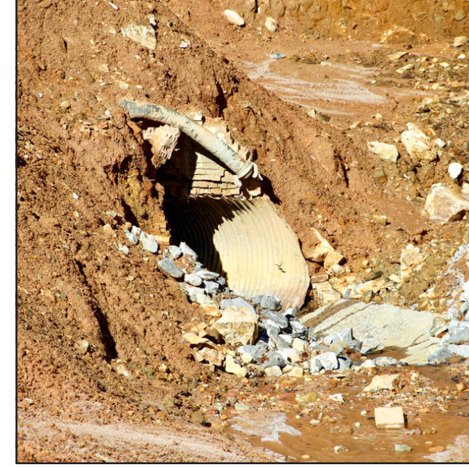
After installing a stormwater pipe and once the City of Blairsville's sewer pipe is replaced, GDOT will work to restore the sinkhole area to its original condition.